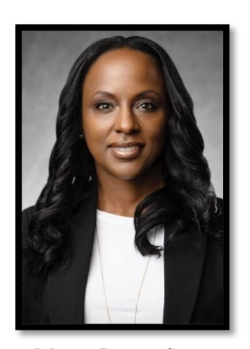
Mayor Donya Sartor