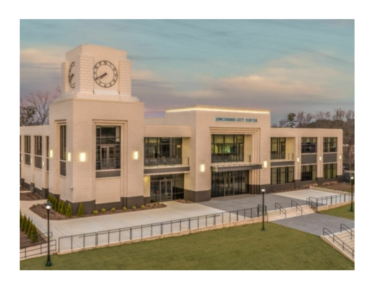
Prepared by: Jonesboro Finance Department